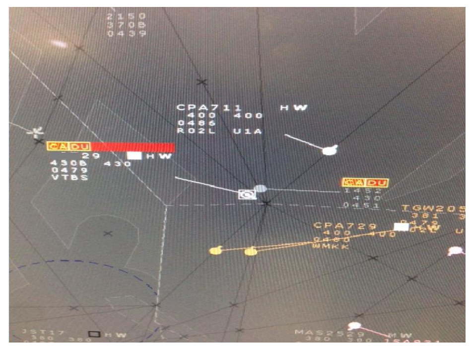
Fig 2: Automation system displaying DUP alerts

2.2 In the radar environment, the automation system will generate a system track in the background, fusing the ADS-B data with the radar data. If the position deviation of the ADS-B track and the radar track is significant, the automation system will display both the radar and the ADS-B tracks on the screen with alerts of 'duplication' on both tracks. Controllers will hence be alerted (see Fig 2) and will take the appropriate actions.